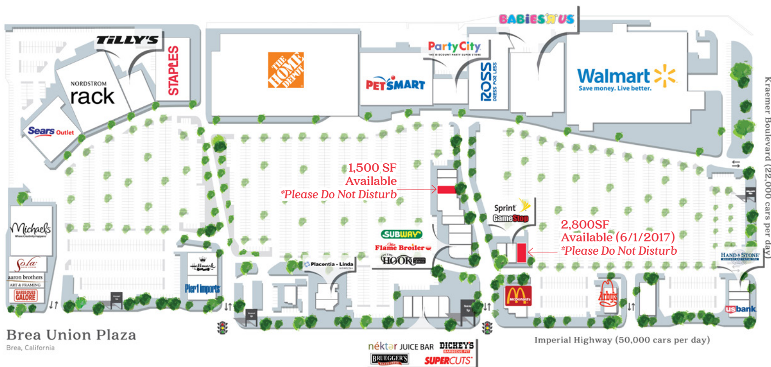
Brea Union Plaza Brea, California